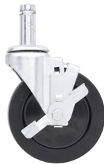
Resilient Rubber Casters