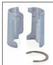
Aluminum Split Sleeves

Bag of four aluminum sleeves with C-rings.