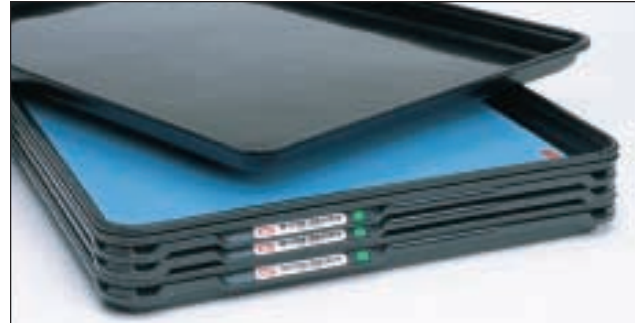
SmartTray™ features barcoding and color coding, and stacks with other trays of the same footprint.

Put the SmartTray advantage to work for you!