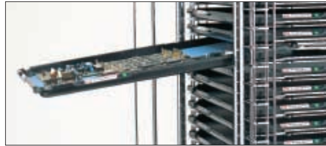
SmartTray™ engages with wire cart design to provide optimum ergonomic access.