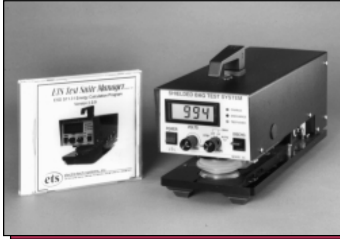
ETS Model 431 shown with optional ETS Test Suite Manager program